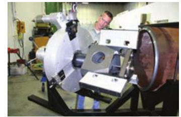
Only eight sets of clamps and two wedges required to cover entire range. Simple to operate, quick to set up.