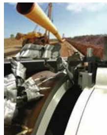
Formed tool bits for wall thicknesses in excess of 2.5".