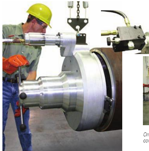
The Terminator is shown with a 5 h.p. pneumatic motor and off-set gear drive that can also be used with the available hydraulic drive.