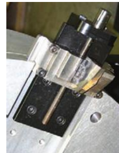
Using the escolock blade locking system the cutter blade is held by the tool post that is attached to the tool base allowing easy, precise alignment to the pipe.