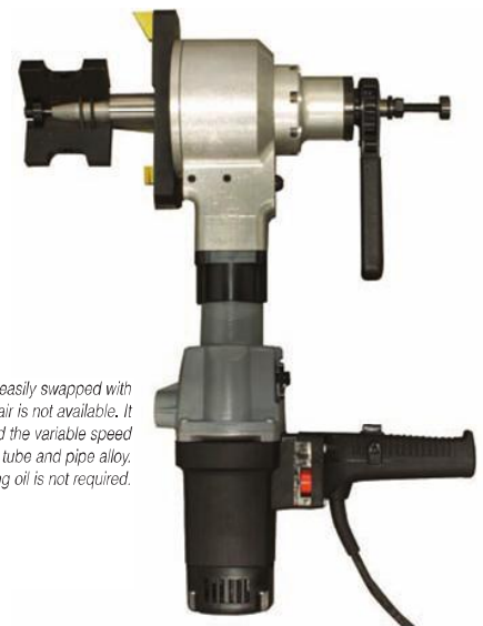
The available electric motor is easily swapped with the pneumatic motor when air is not available. It produces awesome power and the variable speed motor is ideal for all types of tube and pipe alloy. Like the pneumatic drive, cutting oil is not required.