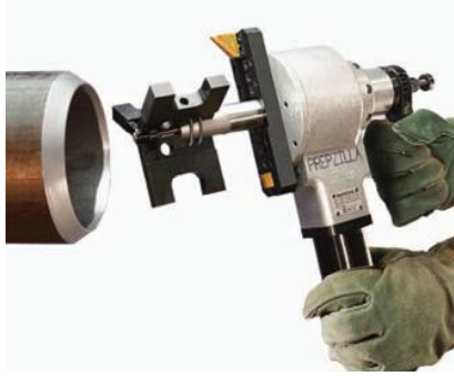
The Prepzilla MILLHOG® cuts heavy wall pipe and tube, producing a heavy chip with no cutting oils; resulting in perfect end preps.

Gear Head, Feed Mechanism, 2 HP Pneumatic Motor (electric may be substituted), 8.625in Tool Post, Draw Rod Assembly, 1.575in Mandrel, Hose with couplings, dirt stopper and oiler, & Carrying Case. (deluxe kit shown that includes all clamp ribs and pads for entire range).