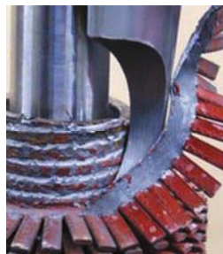
Right hand wound fin.