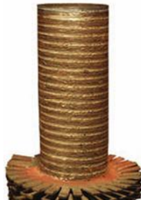
The tube is ready for end prepping after the fin is removed.