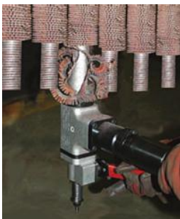
The Fin MILLHOG can remove a 4" fin from a tube O.D. in under two minutes and can be used in any orientation.