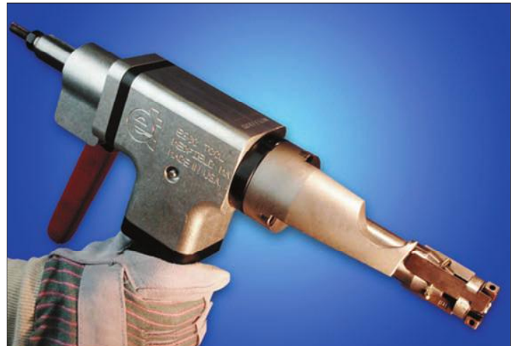
This hand-held fin removal tool features a cutter head that efficiently cuts the bond between the fin and the tube O.D.

Easy to operate, the Fin MILLHOG® does it all. Once it is clamped into the tube I.D. and you engage the throttle, the fin removal head rotates, is fed into the fin, and efficiently cuts the bond between the fin and tube O.D. Built tough, the cutter blade is made from a high grade tool steel that can be resharpened, while a heavy-duty rack and pinion feed mechanism assures smooth operation, without requiring any cutting fluids.