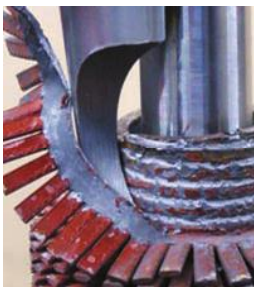
Left hand wound fin.